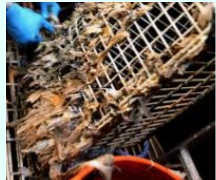
Personal cleansing and baby wipes